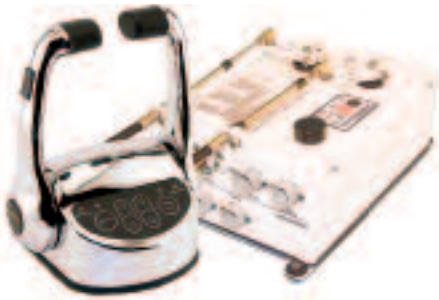
Smart Actuator II™